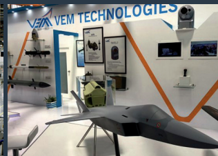
VEM Technologies (NIMZ)

Adjacent - Woxsen University 10 mins - Regional Ring Road (RRR) 15 mins - Mahindra & Mahindra