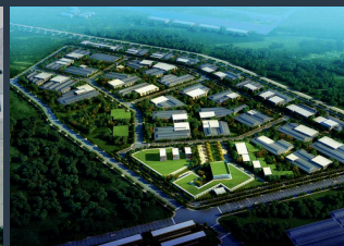
NIMZ Central Govt. SEZ