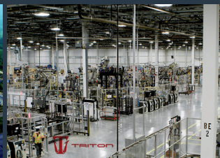
Triton EV (NIMZ)